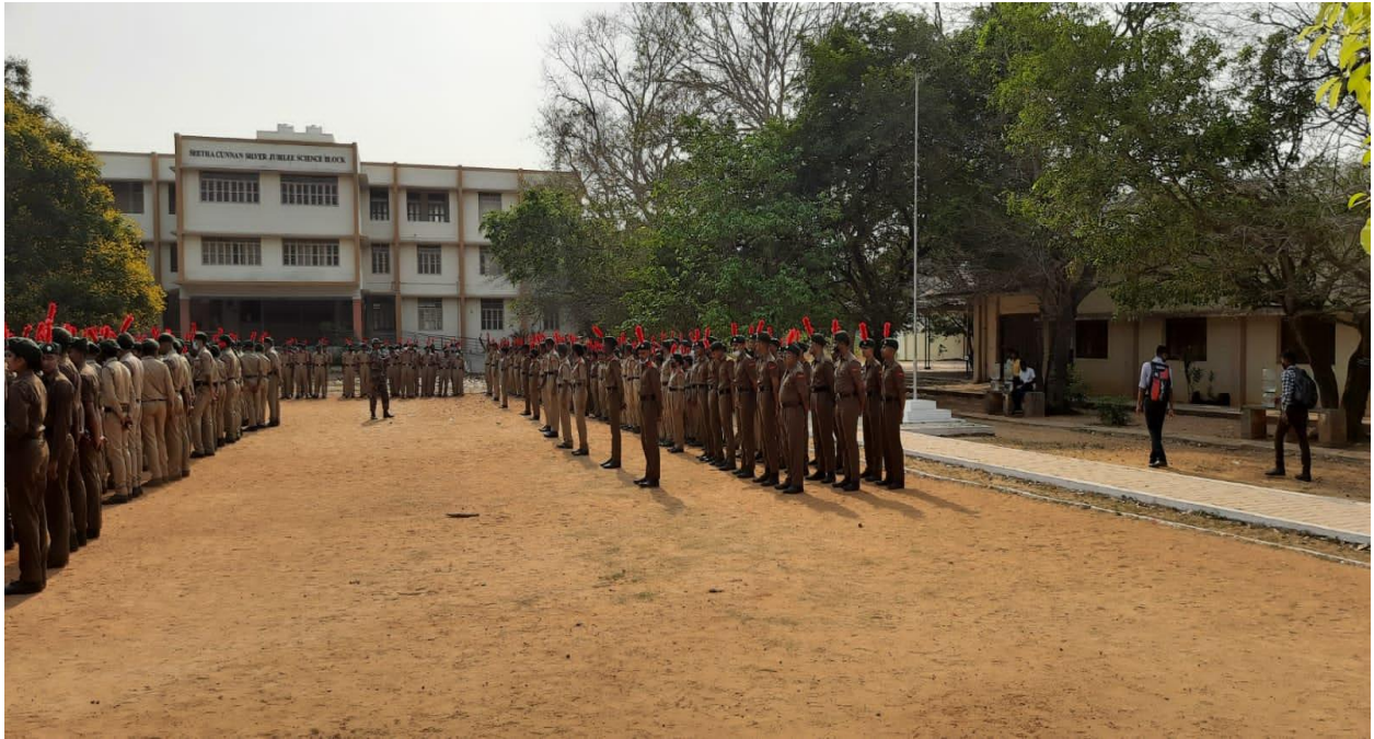
Figure 5. PI Staffs giving Instructions to cadets for written exam.