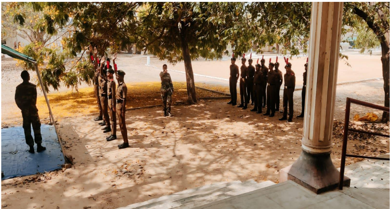
Figure 3. Cadets at Weapon Training practical exam