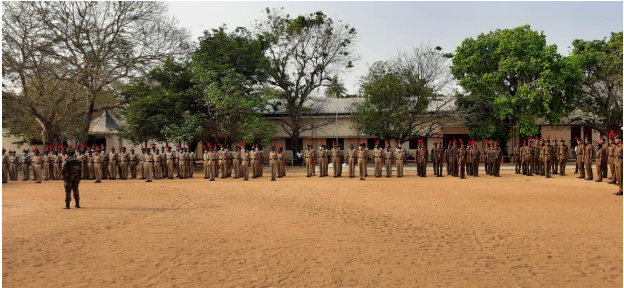
Figure 2. Cadets reporting for practical examinations