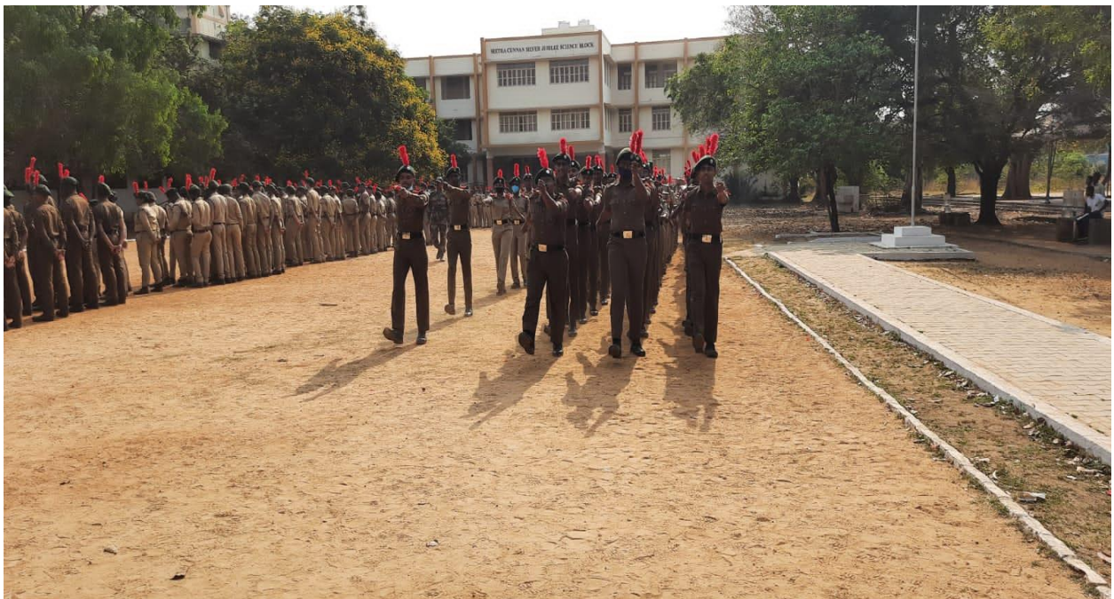
Figure 6. Cadets marching towards exam hall.